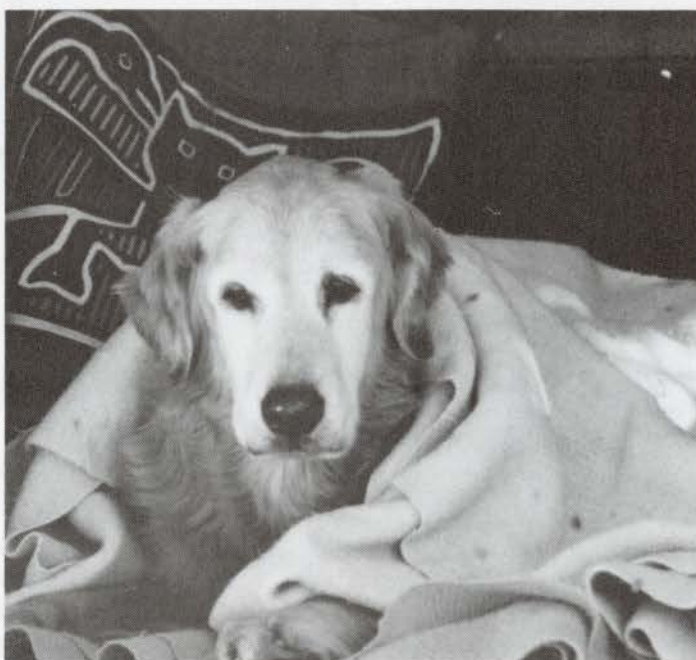
Tahoe, an old guy with a touch of arthritis, is part of the Old Folks contingent at Best Friends.