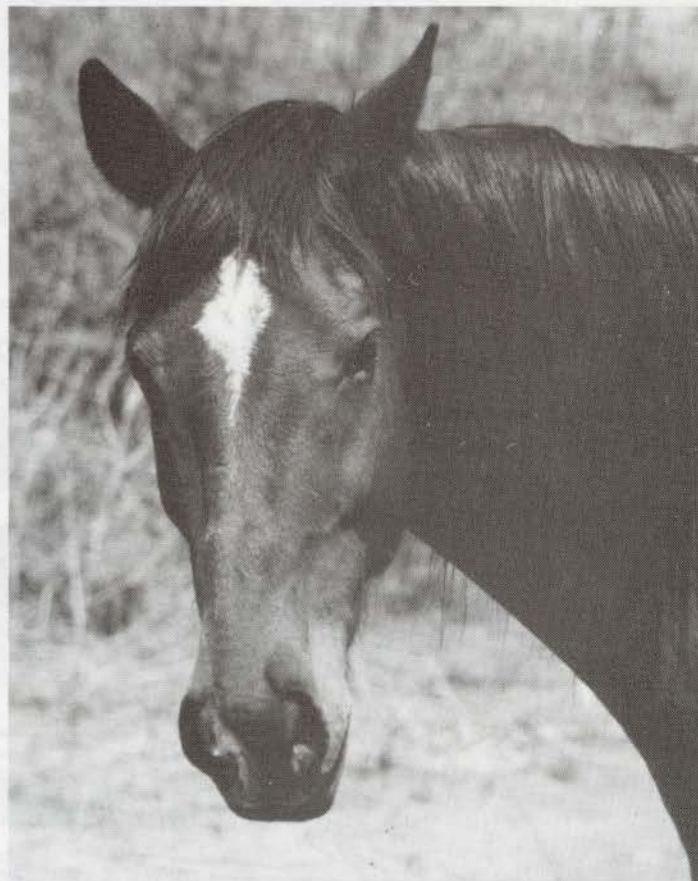
Big Enough was on his way to the slaughterhouse after a long, hard life. Now he's having a long, happy retirement!

If a society is judged by the way it treats its children, its old folks, and its animals, then Best Friends is the dream of a better society for us all. 🐾