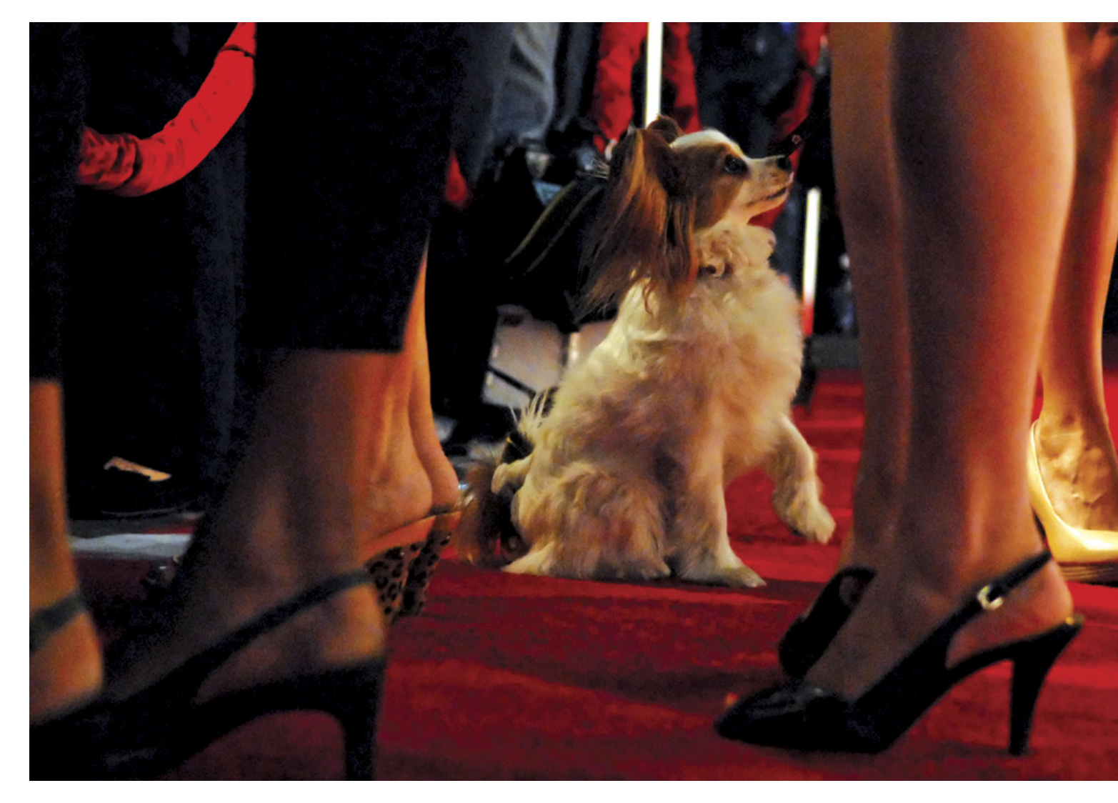
First Home Forever Home